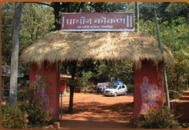
Prachin Konkan – 2.5 km