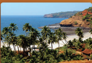
Velneshwar from Ganpatipule City Centre – 27 km