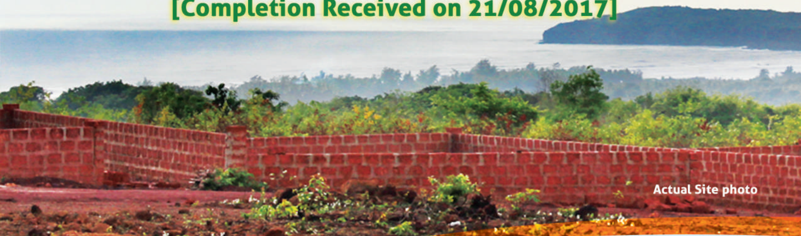
Actual Site photo

Collector Approved Sea View N.A. Plots ranging from 252 to 550 Sq mts available for sale at prime location at Nivendi, Ganpatipule, Dist. Ratnagiri, Maharashtra. [Completion Received on 21/08/2017]