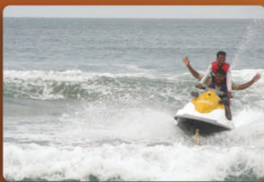
Water Sports at Ganpatipule Beach - 2.5 Km