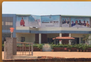
House of Wax – 0.5 km