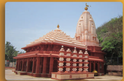
Ganpatipule Temple – 2 km