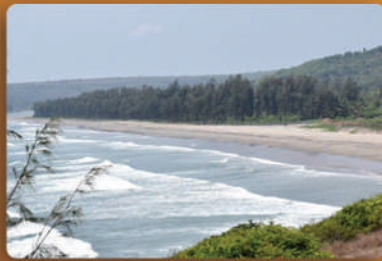
Aare Ware Beach – 9.4 km