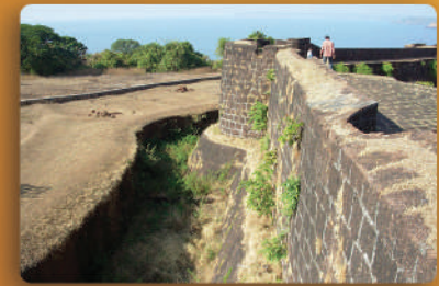
Jaigad Fort – 20.8 km