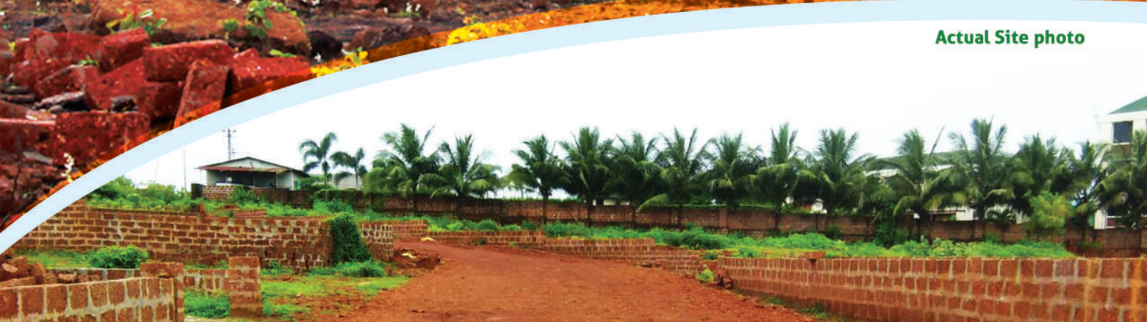
Actual Site photo

Located on Konkan coast with a series of beaches and vantage points offering some stunning views of the sea and the development that Ganpatipule has been witnessing over the last few years, makes it an ideal destination not just for holiday but for investments too!