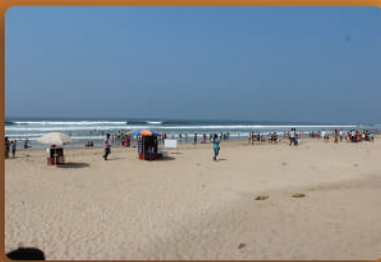
Ganpatipule Beach – 2 km

The prime attractions in and around our plot location at Nivendi, Ganpatipule are: